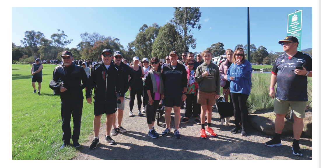
Continued on Page 2....

Our additional fundraising activities were very successful with Maroondah Rotary again providing a delicious BBO, our first ever EPC Cake Stall and our raffle of the Christmas Hamper, courtesy of Heritage and Heritage Funerals.